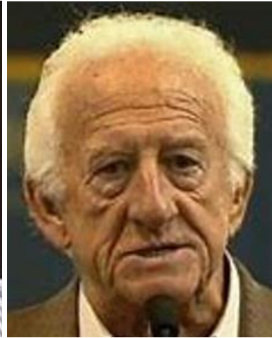
FUN TIME HOOTER & BOB UECKER