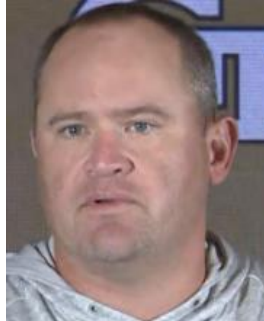
Fulton County Jail Mug Shot of the Week

THE COMPLETE SEPARATED@BIRTH? COLLECTION THE LOGOS & MASCOTS COLLECTION THE REPTILES COLLECTION