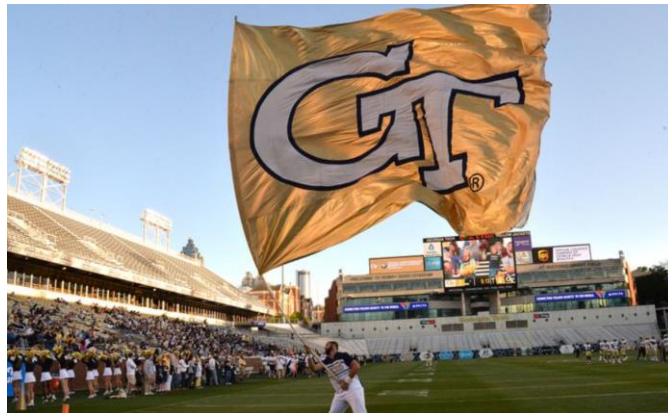
Another packed house for Game Day on the Flats