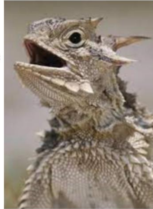
& DESERT CRUISER HORNED LIZARD

THE COMPLETE SEPARATED@BIRTH? COLLECTION THE LOGOS & MASCOTS COLLECTION THE REPTILES COLLECTION